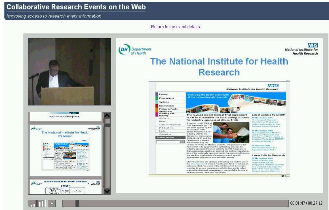
Figure 1. Example of a prototype (pilot release 1) of the CREW replay application

overview on the left and the actual slide in the main view – is configurable in the editing process and can be presented differently in the progress of the event. The slide overview then might show thumbnails of questions and answers to jump to, with the main window showing the speaker or the audience. The control elements in the bottom bar provide functionality to control the recording (loudness, play/pause, position bar, elapsed time, total time).