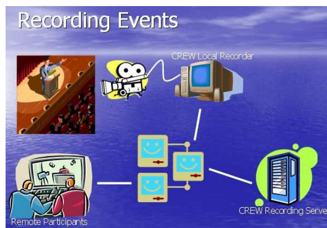
Figure 2. Recording events usage scenario visualization

The first of these activities comprised of user requirements sessions, so-called User Days, which have been held with each of the three user groups. The findings have been compiled within the CREW User Requirements Report (cf. Poschen, 2007). Each event lasted about four hours with 4-5 users participating and included an introduction to the project together with a description of development plans as well as an interactive session to understand users' needs, specific requirements and likely usage scenarios. The intended outcomes of the day were for users to understand what CREW is about and for the development team to understand what users really need. Additionally a questionnaire, devised by the Oxford e-Social Science node 12 considered legal, social and ethical issues that may result from use of CREW was distributed at these events; the analysis is currently under way.